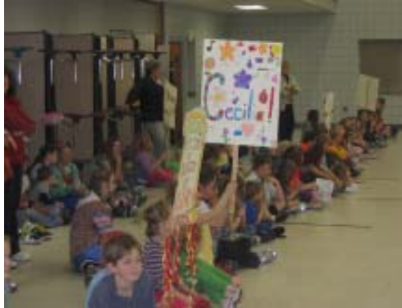
Catholic Schools Week Spirit Olympics